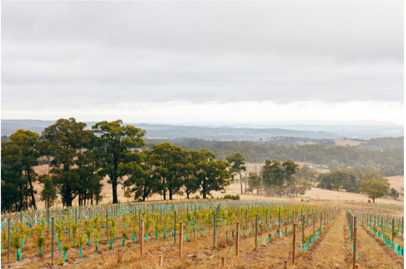
Don Valley, Australia