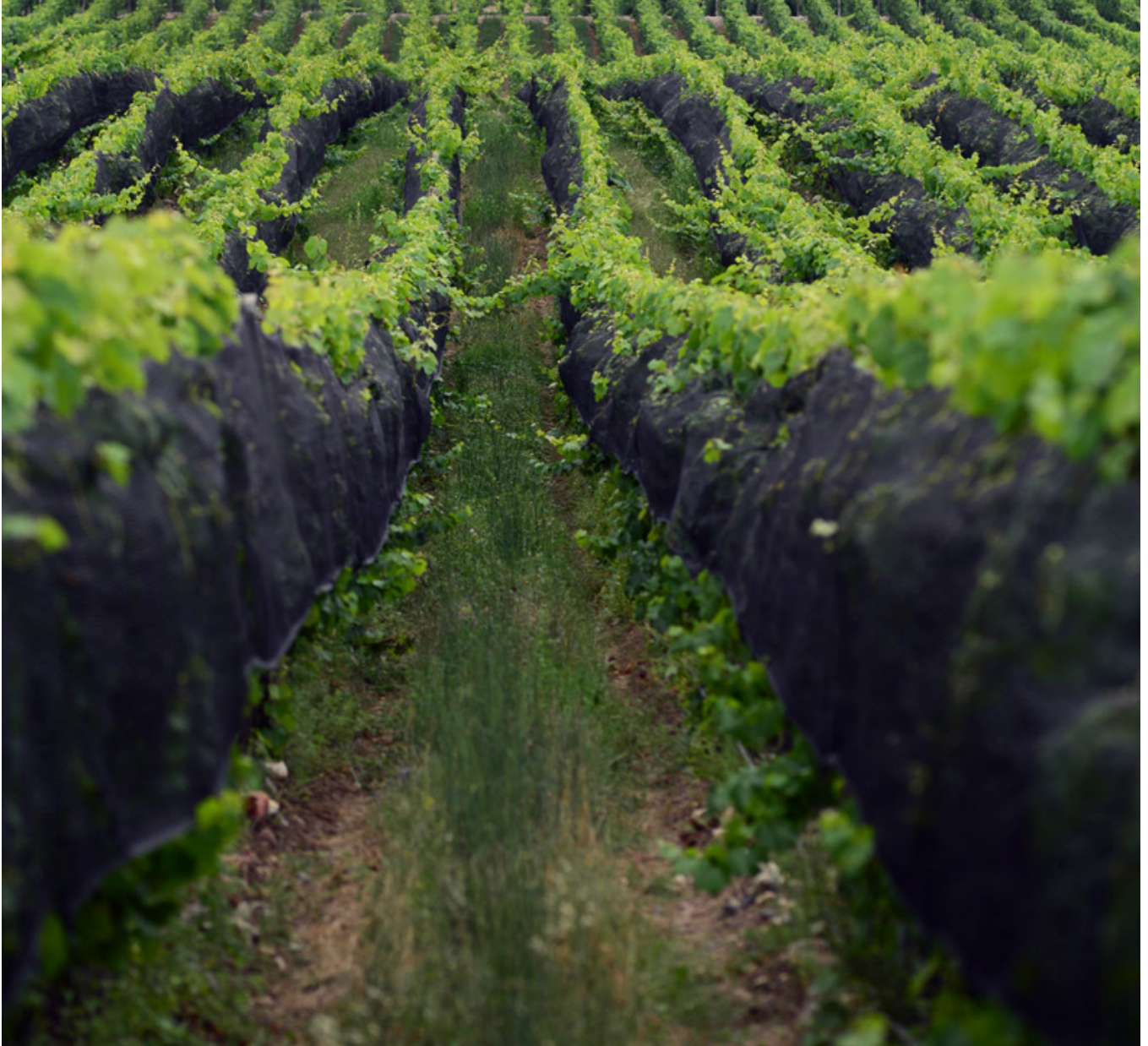
Catena Zapata, Argentina

Today, vineyards in the regions of Salta and Jujuy in northern Argentina are at altitudes of 5,000 to 11,000 feet, among the highest vineyards in the world. In the Walla Walla Valley of Washington State, growers are experimenting at 3,000 feet, higher than ever in the region.